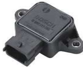
Figure 5: Throttle position sensor

A throttle position sensor (TPS) is a sensor used to monitor the throttle position of a vehicle. The sensor is usually located on the butterfly spindle/shaft so that it can directly monitor the position of the throttle. The TPS sensor is a potentiometer, providing a variable resistance depending on the position of the throttle valve (and hence throttle position sensor). The sensor signal is used by the engine control unit (ECU) as an input to its control system. The ignition timing and fuel injection timing (and potentially other parameters) are altered depending on the position of the throttle valve, and also depending on the rate of change of that position.