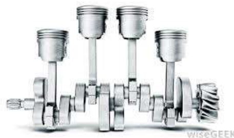
Figure 6: Piston

Pistons are at the very heart of the reciprocating internal combustion engine, which is why they are often called a "piston engine". At its most basic, the piston is simply a solid cylinder of metal, which moves up and down in the hollow cylinder of the engine block. The piston is attached via a wrist pin to a connecting rod, which in turn is connected to the crankshaft, and together they turn the up and down (reciprocating) motion into round and round (rotational) motion to drive the wheels.