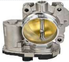
Figure 1: Throttle body