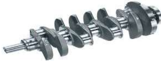
Figure 8: Crankshaft

A crankshaft is a fundamental feature in a vehicle's engine. It is the system that converts linear energy into rotational energy. This enables the wheels to drive the car forward. All the pistons in the engine are attached to the crank which is also connected to the flywheel. The crankshaft moves the pistons up and down inside the cylinders. The movement of the pistons is regulated by the crankshaft. When the shaft moves, it causes the flywheel at the end of the shaft to adopt a circular motion. This motion eventually causes the vehicle's wheels to turn since the flywheel is connected to other engine parts.