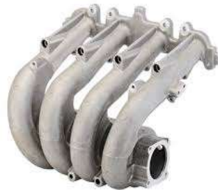
Figure 2: Intake manifold

An intake manifold is a component that delivers either air or an air/fuel mixture to the cylinders. The design of these components varies widely from one application to another, but they all perform that same basic function, and they all have a single input and multiple outputs.