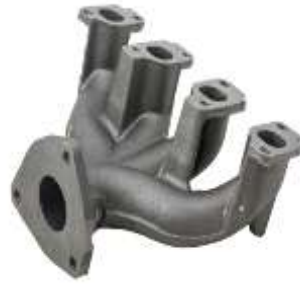
Figure 10: Exhaust manifold