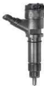
Figure 3: Fuel injector

A fuel injector is nothing but an electronically controlled valve, supplied with pressurized fuel, and it is capable of opening and closing many times per second. The injectors are mounted in the intake manifold so that they spray fuel directly at the intake valves. A pipe called the fuel rail supplies pressurized fuel to all of the injectors. When the injector is energized, an electromagnet moves a plunger that opens the valve, allowing the pressurized fuel to squirt out through a tiny nozzle. The amount of fuel supplied to the engine is determined by the amount of time the fuel injector stays open. This is called the pulse width, and it is controlled by the ECU.