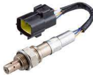
Figure 11: Oxygen sensor

The Oxygen sensor (lambda sensor) is mounted in the exhaust manifold to monitor how much unburned oxygen is in the exhaust as the exhaust exits the engine. Monitoring oxygen levels in the exhaust is a way of gauging the fuel mixture. It tells the computer if the fuel mixture is burning rich (less oxygen) or lean (more oxygen).