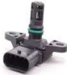
Figure 4: Map sensor